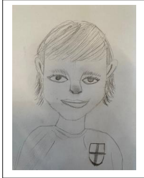
Headteacher & SENDCo